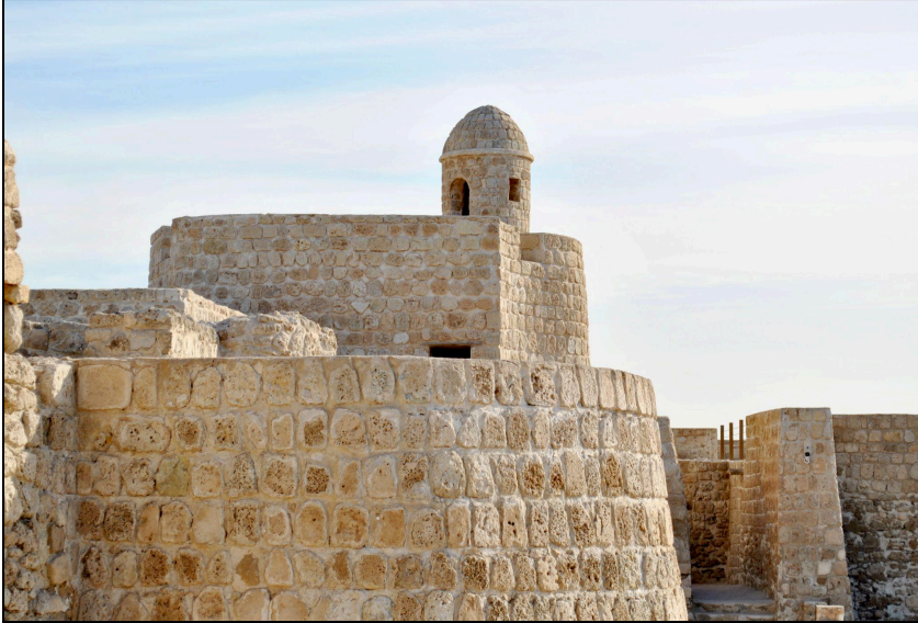
Step Back in Time: Explore ancient wonders like the UNESCO-listed Qal'at al-Bahrain.

Bahrain is a treasure trove of experiences: