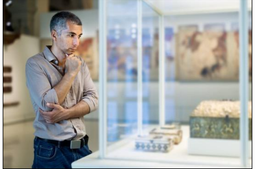
Dive into Culture: Visit the Bahrain National Museum or join in local festivals.