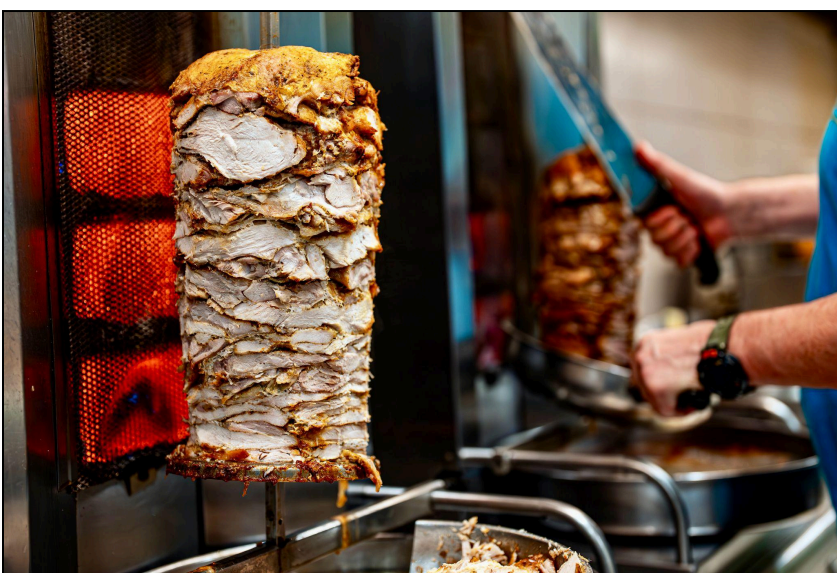
Taste the Flavours: Savour a mouthwatering fusion of Arabian and international cuisine.