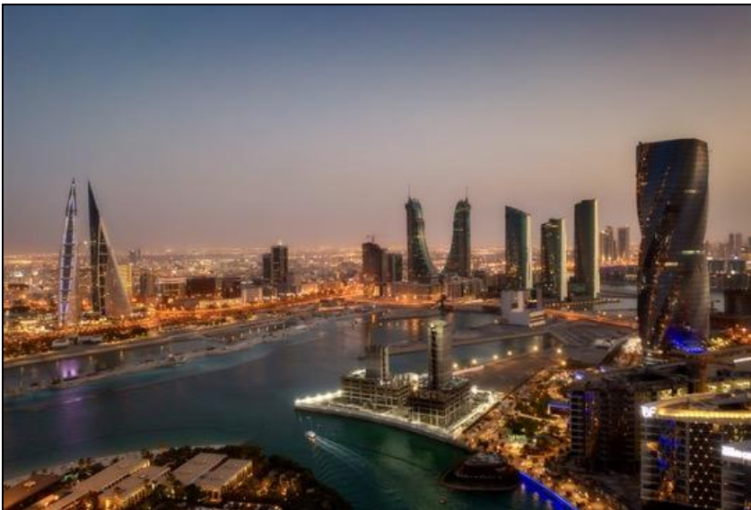
Marvel at Modernity: Check out landmarks like the Bahrain World Trade Center.