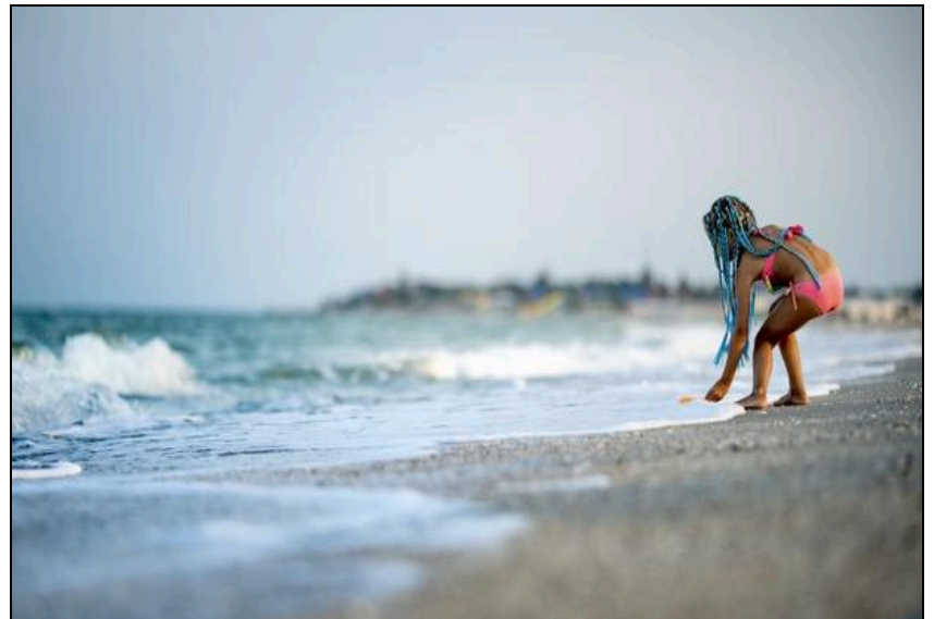
Soak in Nature: Wander by the serene Tree of Life or relax on sunny beaches.